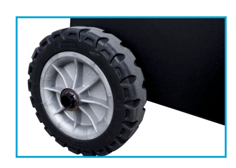
LARGE WHEELS FOR EASY DRIVING