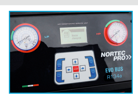
CLEAR CONTROL PANEL