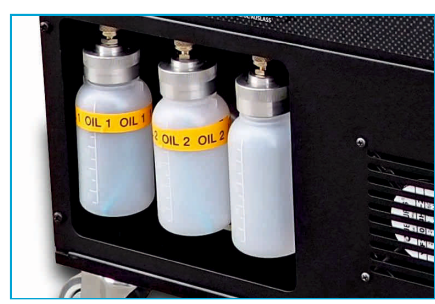
OIL TANKS AS STANDARD