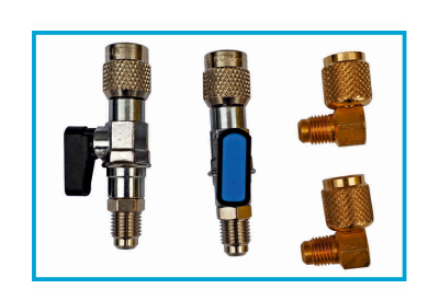
ADDITIONAL CONNECTOR KIT TO BUSES